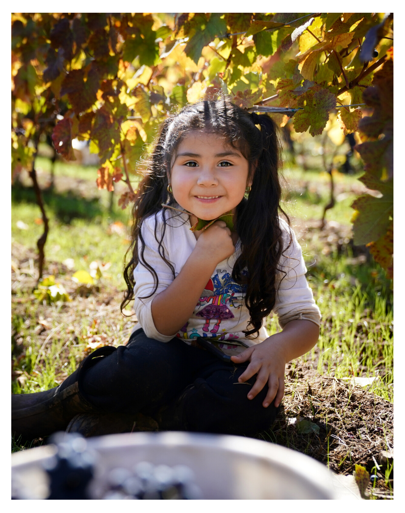
A HOLISTIC APPROACH TO COMMUNITY HEALTH